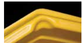
Convenient pour spout