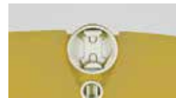
Built-in bung fitting holder

Perfect for use as a drum pumping station!