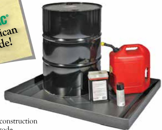
2-DRUM ECONO SPILL SHELL™