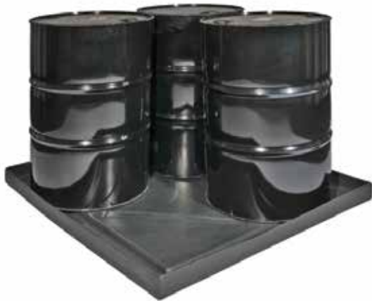
4-DRUM ECONO SPILL SHELL™

Engineered drainage channels help facilitate the flow of spilled liquids away from containers for safe and effective clean-up.